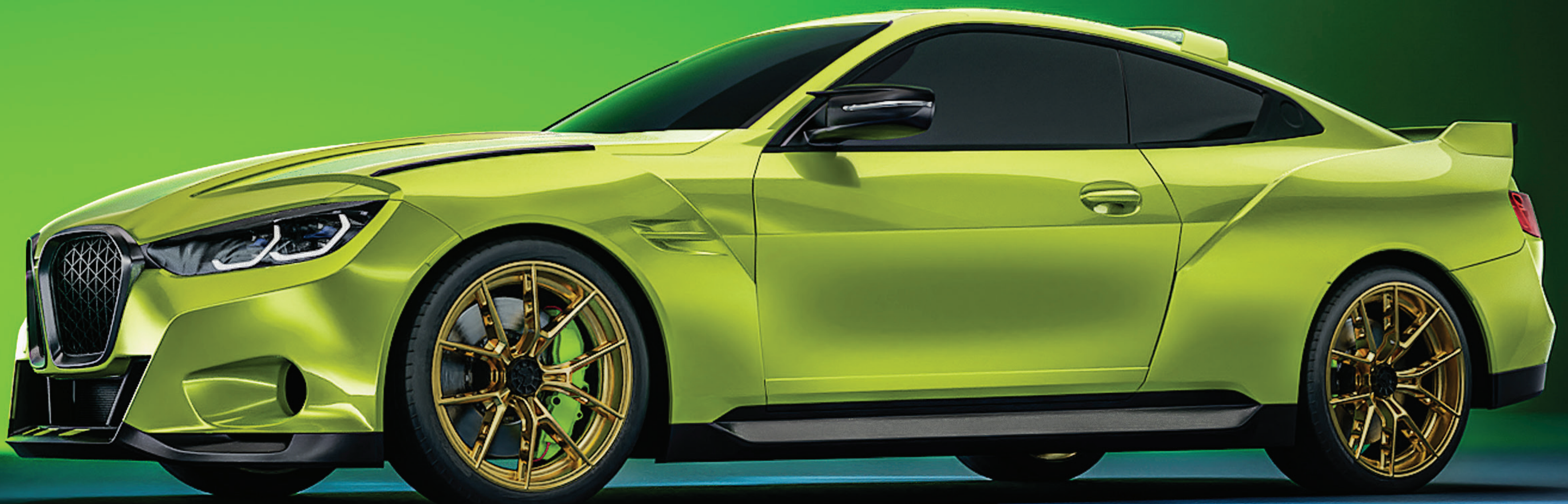
High Gloss Citric Acid